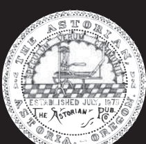
THE DAILY ASTORIAN