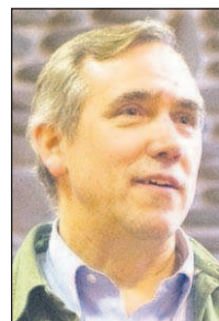
Sen. Jeff Merkley

The U.S. Geological Survey and four partner universities are seeking $16.1 million in federal funding to launch and maintain the West Coast Earthquake Early Warning System. If funded, the system could be up and running within two years.