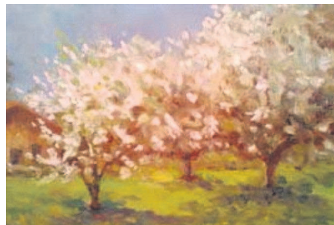
Oils by Wim Vlek are on display at Pacific Crest Cottage.