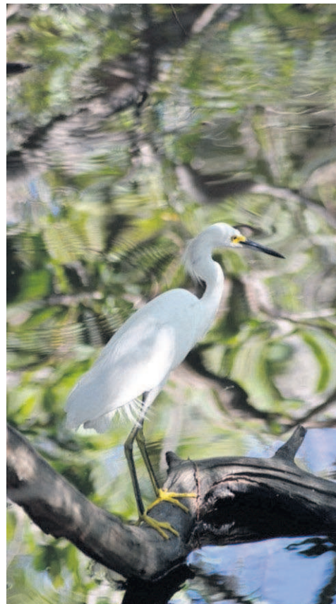
Vikki Rennick photograph, "Reflecting Pond Egret."