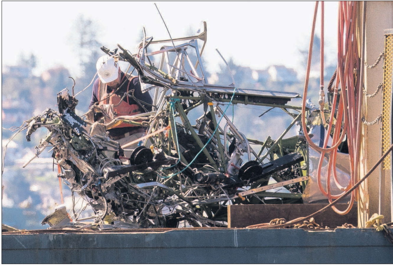
Crews inspect plane debris onboard a barge on Tuesday.

The National Transportation Safety Board, which has launched an investigation of the crash, will document the plane — "the systems, the flight control, making sure that they have the entire aircraft, and seeing if there's any signs of any sort of pre-crash failure