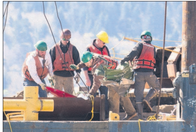
Crews remove plane debris from the Columbia River on Tuesday. See more photos online at www.dailyastorian.com