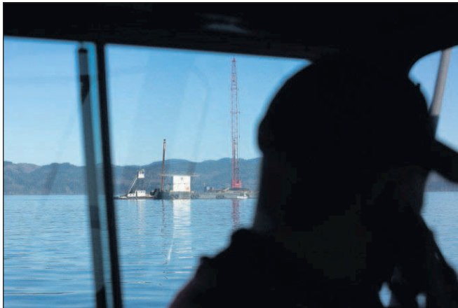
Crews position the barge as they prepare to remove plane debris from the Columbia River on Tuesday.

The whole process of cleaning up after a tragedy — from the search for human remains,