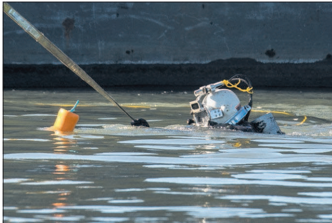
A diver goes into the river near a buoy marking the location of the plane during a recovery mission on Tuesday.