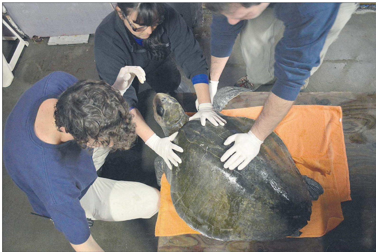
A rehab team at the Oregon Coast Aquarium in Newport examines Thunder, an olive ridley sea turtle who washed ashore in Gearhart in December.