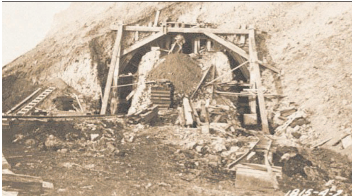
The Arch Cape Tunnel.