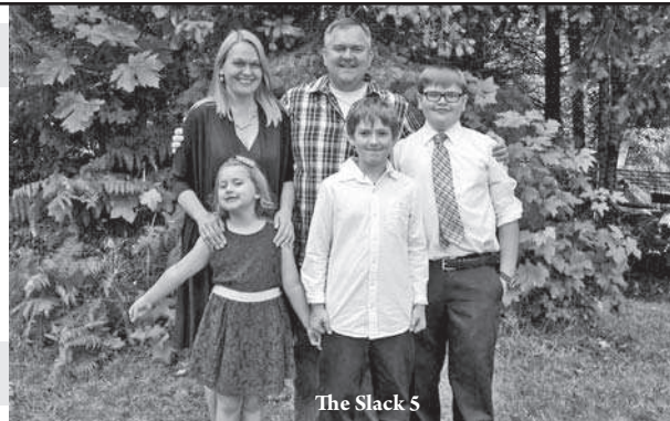
The Slack 5