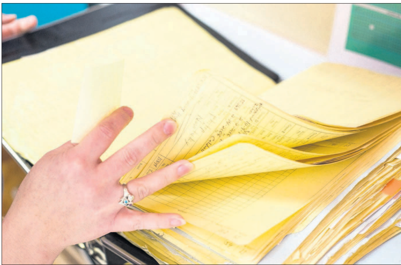
Terra Patterson flips through a book of burial permits, dating back to the early 1900s.

Since 2014, Scott, city staff and volunteers, have pulled burial data from the cemetery's