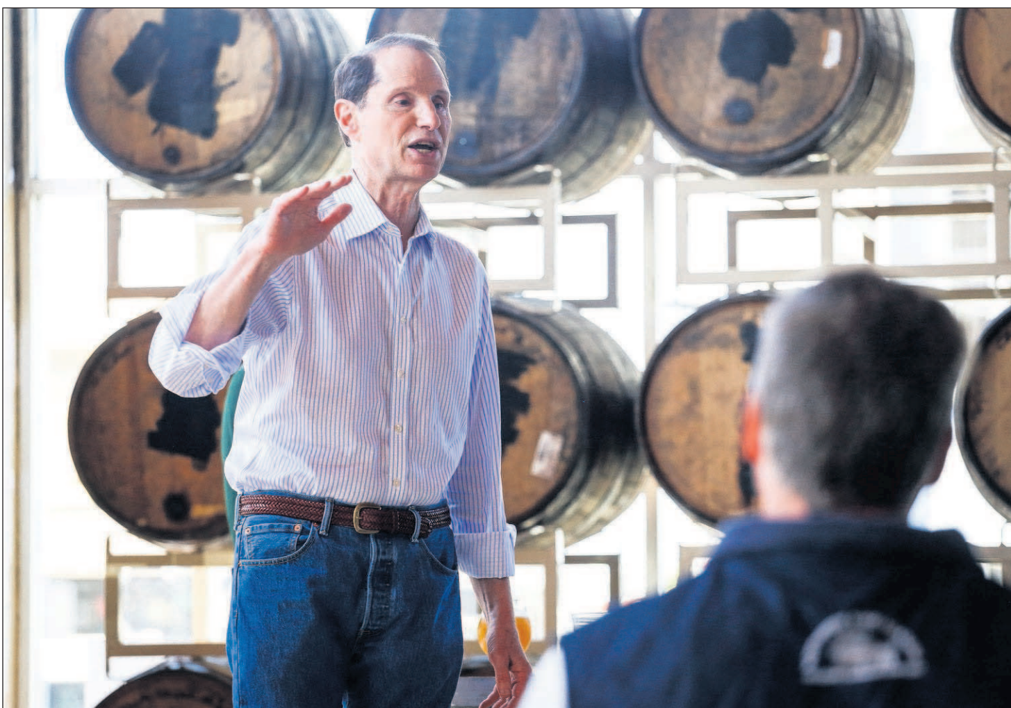
Sen. Ron Wyden speaks during a group discussion at Fort George Brewery in July. The discussion was part of Wyden's tour of Oregon's seven wonders to promote the economic impact of tourism and recreation.