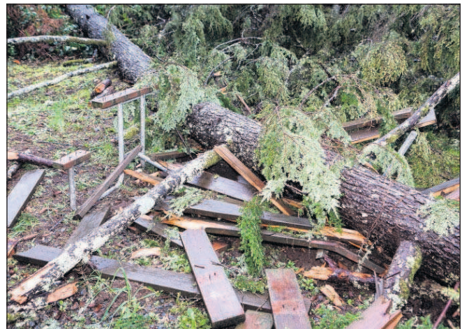
There is no doubt that some of the spruce trees in Bush Pioneer County Park needed to be cut down for safety reasons. This rotting spruce tree destroyed a picnic table when it fell during a windstorm in early March.

stopped by the local café a day or so before the harvest and told patrons the county planned to cut down "a few leaners." Whitford said he assumed the Department of Public Works only planned to cut down damaged trees, and agreed that the work was a good idea. So he was surprised when they cut down the tall trees on the edge of the park, rather than the more obviously diseased and ivy-covered specimens inside the park.