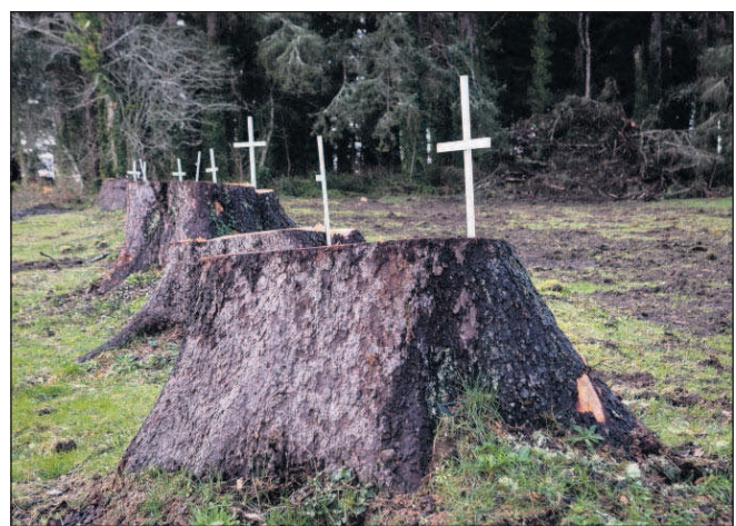
Bay Center resident Monica Pine made these crosses to show her dissatisfaction with the county's decision to cut down 19 trees in Bush Pioneer County park.