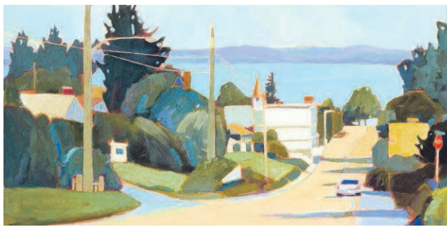
"Drive Into Town" by Lisa Snow Lady at Imogen Gallery.

Share a quick snack and beverage, visit with friends, check out the new spring line, and admire local and regional art.