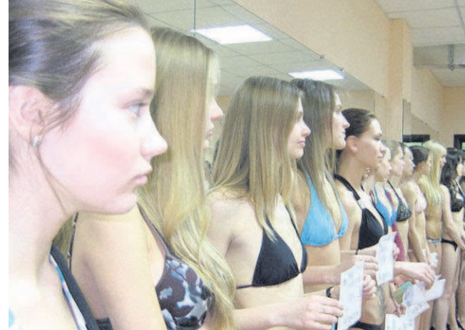
The POV documentary “Girl Model” takes a sober look inside the modeling industry.

“Girl Model” puts the lie to the glamorous portrayal of modeling provided by reality television programs and the glitzy images on the covers of