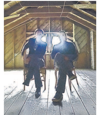
Submitted photo Psychedelic band Stunning Rayguns will perform March 4 at KALA.

MTV, NYLON, L Magazine, CBS, Stereomood, Soundcloud, along with various blogs and college radio stations.