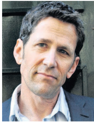
Author Jess Walter will be the keynote speaker Saturday evening.

• Jonathan Evison: Evison's book "West of Here" won the 2012 Pacific Northwest Booksellers Association award and was named Book of the Year by Hudson Book-