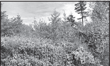
OPPORTUNITY KNOCKS Lisbon, Astoria • $65,000

Let your imagination run wild! This exceptional single family home building site affords views of Young's River and coastal mountains. Enjoy the country experience yet be close to Astoria and services. Septic approval in place and utilities close at hand. This nearly 3 acre site has it all.