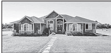
ROOM FOR TOYS & STORAGE 89975 Surf Pines Landing Dr Warrenton • $579,000

Extremely well cared for Columbia River view craftsman in Astoria's historic Uniontown neighborhood, close to goods and services and public transportation. Wood floors, original finish detail, cozy kitchen and nook with built ins, formal living and dining, full basement, three spacious bedrooms, room for a garden and so much more. Bonus detached shop. Call for a private showing.