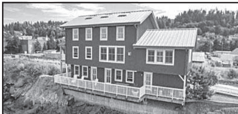
UNFORGETTABLE WATERFRONT 396 31st St, Astoria $989,000

Jensen-designed oceanfront contemporary built by Paul Caruana. Expansive views from most rooms in this nearly 4,000 sq ft home located in Gearhart's premier gated development, Pinehurst. Custom finishes throughout include cherry floors, tile/stone detail, 3 gas fireplaces, an elegant master suite, and more.