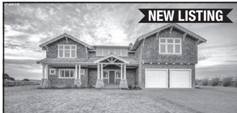
EXCEPTIONAL CRAFTSMANSHIP 89329 Pinehurst Rd, Gearhart • $1,175,000

Jensen-designed oceanfront contemporary built by Paul Caruana. Expansive views from most rooms in this nearly 4,000 sq ft home located in Gearhart's premier gated development, Pinehurst. Custom finishes throughout include cherry floors, tile/stone detail, 3 gas fireplaces, an elegant master suite, and more.