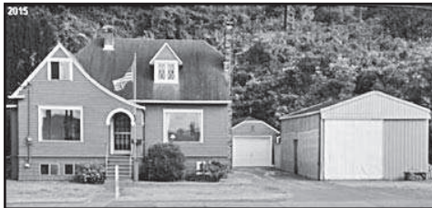
RIVER VIEW UNIONTOWN CRAFTSMAN 445 W Marine Dr., Astoria $199,950

Cell: 503-440-7474 Office: 503-325-5111 Toll Free: 877-949-5111