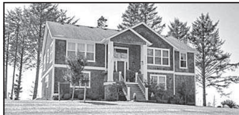
CUSTOM PACIFIC BELLEVUE SPLIT LEVEL 90822 Kennedy Rd Warrenton • $598,000

Experience waterfront living in historic Astoria at its finest. This Columbia Riverfront home was custom designed and built for its owner by craftsman Rich Elstrom, blending the best of both indoor and outdoor living experiences. Two levels feature the finest finish detail, including an open upper level floor plan with tall ceilings and walls of windows and a more intimately designed main floor bedroom and office wing.