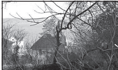
WEST HILLS COLUMBIA RIVER VIEW LOT 1st & Exchange, Astoria • $65,000

2 bedroom, 1 bath bungalow featuring an eat-in kitchen, spacious living room. Bonus addition, perfect for family room, third bedroom or workshop on a .89 acre level lot.