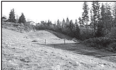
LOOK NO FURTHER! W. Jerome, Astoria • $225,000

Two unimproved lots overlooking the Columbia River in the historic Uniontown area of Astoria can be developed as a single building site. Let your imagination run wild as you design your dream home. Privacy and a sweeping vista can be yours!