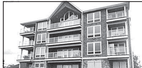
SPECTACULAR 3RD FL CONDO 900 N Prom #301, Seaside • $399,900

Located in the gated community of Pacific Bellevue, this custom Ben Johnson built ocean view home features a split level design, a quality finish aesthetic throughout and light-filled rooms. Formal living and dining, an inspired chef's kitchen, 4 bedrooms, including a spacious master suite with fireplace sitting room, spa bath and large walk-in closet. Decks to take in the views.