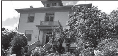
OWN A PIECE OF ASTORIA'S HISTORY 1567 Jerome St., Astoria • $525,000