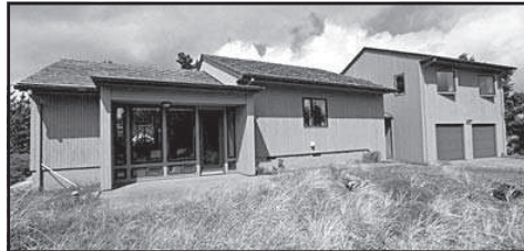
SURF PINES OCEAN VIEW

If you are looking for a Central Astoria historic jewel, this extraordinary example of classic Colonial Revival architecture has it all! Expansive views of the Columbia River from most rooms. Formal living and dining rooms that speak to the elegance and workmanship of times past. 4 plus bedrooms, 2.5 bathrooms. A private, south-facing sunroom, and a bonus, detached studio or guest suite.