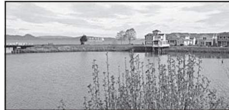
MOST DESIRABLE LOT

This Pacific Ocean view two-level custom NW contemporary home is situated on a 1.07 acre lot, featuring mature landscaping and privacy galore. Gracious, open floor plan, featuring slate and wood finishes. Master suite on main level. Elegant living and dining with abundant light. Outstanding kitchen, perfect for entertaining and so much more.