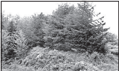
COUNTRY EXPERIENCE 90995 Highway 202 Adj $82,500

Absolutely one of a kind opportunity for the savvy developer or buyer looking to acquire an estate sized lot in one of Astoria's finest neighborhoods. Already a planned subdivision with completed surveys and staged for utilities, this extraordinary parcel offers the potential for 9 buildings sites. Views of Youngs Bay, privacy. The best of all worlds.