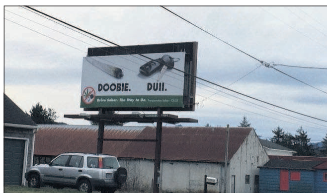
A billboard warning of the consequences of driving under the influence in Seaside.