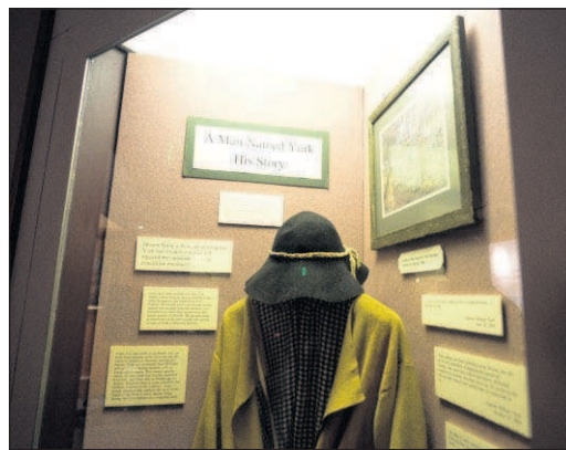
A display about William Clark's black slave York is shown at the Lewis and Clark National Historical Park visitor center.

Read about three African-Americans who impacted Clatsop County in its early days. Page 10A