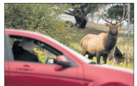
Drivers pull over to take photos of a bull elk in Hammond in September.