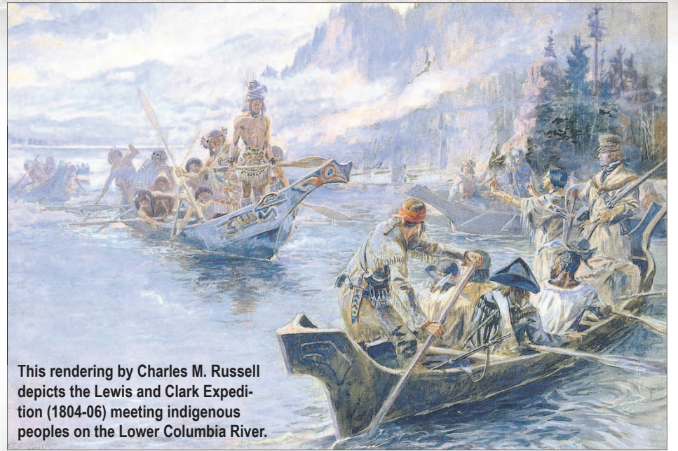
This rendering by Charles M. Russell depicts the Lewis and Clark Expedition (1804-06) meeting indigenous peoples on the Lower Columbia River.

1824 Office of Indian Affairs is established within the Department of War.