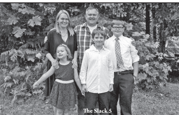
The Slack 5