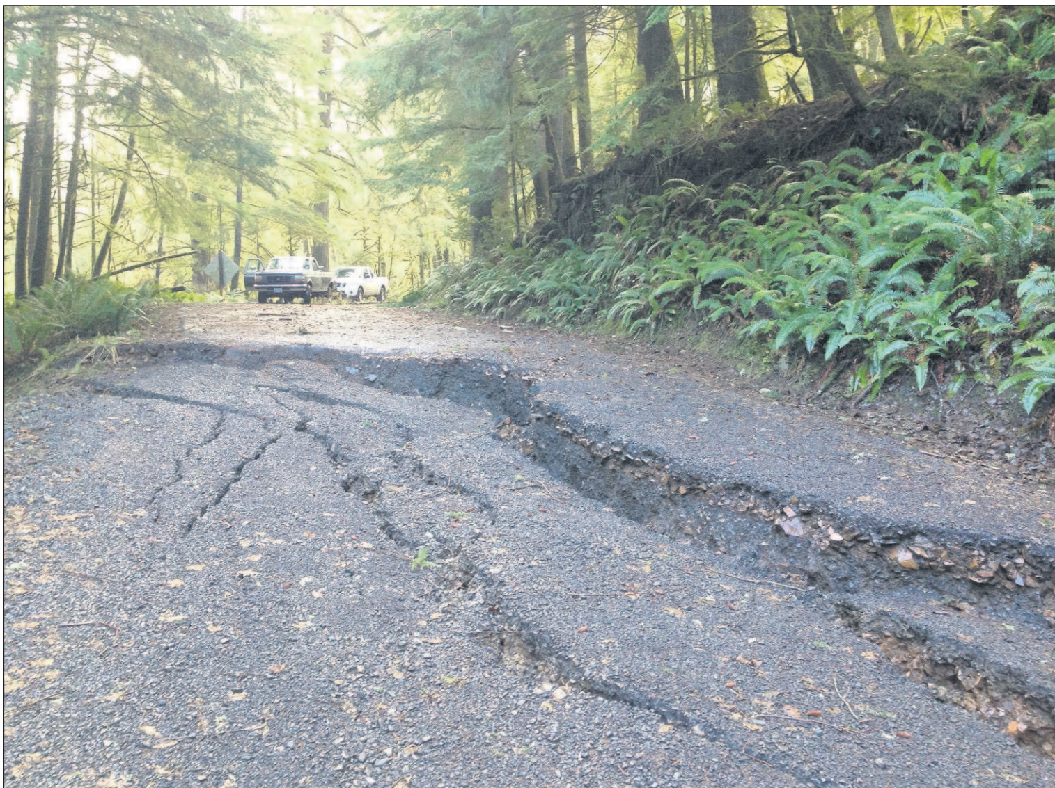
The Oregon Parks and Recreation Department, which closed Ecola Park Road because of erosion, reported $183,000 in damage from December's storms. Submitted Photo

She gave the example of Bond Street behind the Astoria Mini Mart, which became one-way after a landslide in 2007. In 2011, the city replaced a water line displaced by the landslide to Marine Drive, which Brown said was covered by FEMA. She added that the landslide wasn't covered, but remains a city project to return the street to two-way traffic.