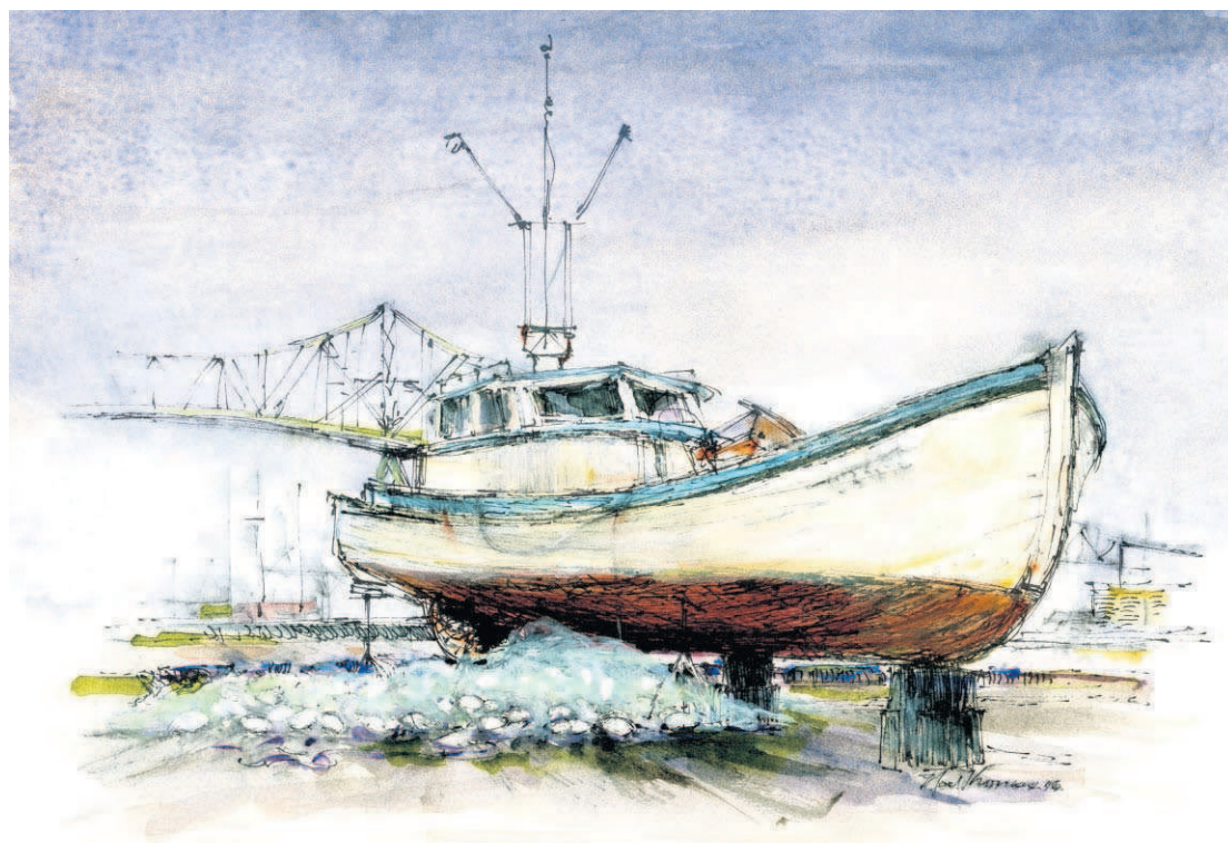
ABOVE: This old gillnetter is at the boatyard in the West End Mooring Basin. It's in pretty bad shape, but I think it's going to be saved. I hope so. RIGHT: This one is so old there is no name visible on its rusting hull. It's been tied up near the 39th Street pier for years next to the Red Eagle, which is in the same sad condition. It rained a little on this sketch, too.