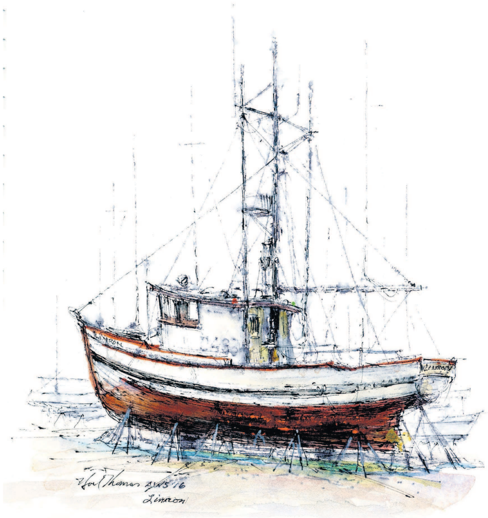
I did this boat one afternoon on location at the West End Mooring Basin. It's the Linron, a great-looking little boat that someone is trying to put back together. You can see from the fuzziness of the sketch that the rain joined us for a while.