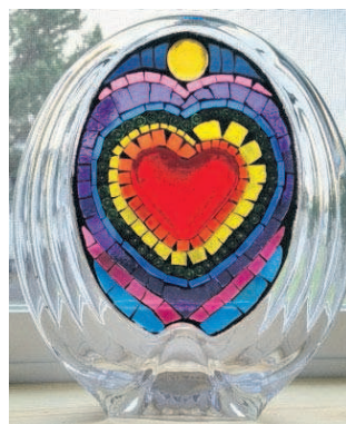
“Heart Beat” is a piece of glass work.

On the tour are the Bette Lu Krause Studio, Naquaiya Studio, Bay Avenue Gallery, Forgotten Treasures Antiques and Collectibles Mall, Weir Studios, and Beach Home Old and New.