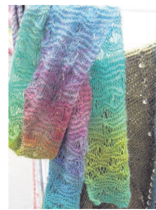
Naquaiya Studio will have many knitted items on view and for sale.

Sign up to be on the group’s private email list and you will