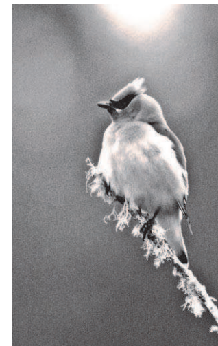
Look for birds during the Great Backyard Bird Count.

For more information, call the park at 503-861-2471, or check out www.nps.gov/lewi , or Lewis and Clark National Historical Park on Facebook. Lewis and Clark National Historical Park is located at 92343 Fort Clatsop Road.