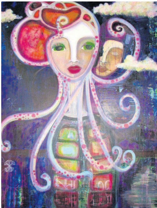
An acrylic/mixed-media piece from Kari J. Young's Beetle Girl/Goddess series at Studio 11.

On display are antique African masks, vintage Japanese silk haori "wearable art," and Japanese wood-