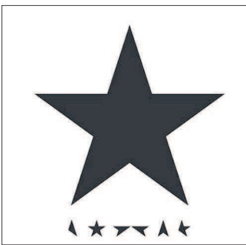
"Blackstar," David Bowie

The Daily Astorian invites people to share the music they are enjoying and describe a few thoughts about the work. This week, Krist Novoselic, a musician, political activist and grunge enthusiast who was the bass player for Nirvana, gives us his playlist. Novoselic, who lives in Wahkiakum County, Washington, can be heard occasionally on Coast Community Radio as DJ-Know. He finds great satisfaction in growing potatoes. To submit a playlist, send to news@dailyastorian.com