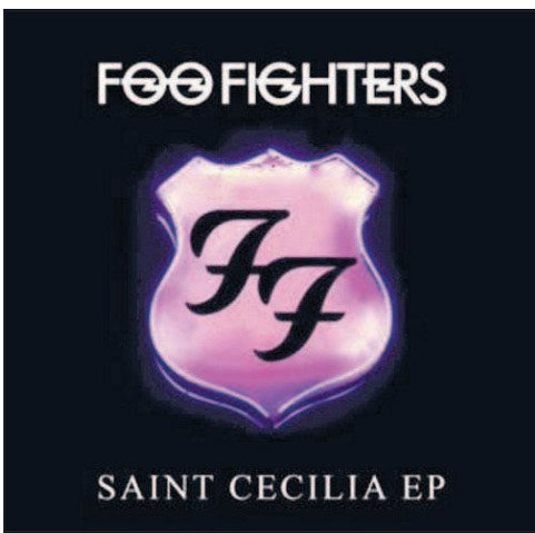
"Saint Cecilia," Foo Fighters

Foo Fighters' "Saint Cecilia" is a statement on how they are the biggest rock band in the world. I downloaded this free EP off the Internet. I bought 2011's "Wasting Light" CD at the Fred Meyer in Warrenton — even though I played on it! It matters not that nobody remembered to send me a copy because they thought enough of me to invite me into the