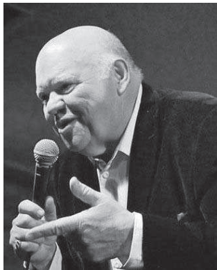
Comedian Mike "Wally" Walters will headline both shows.