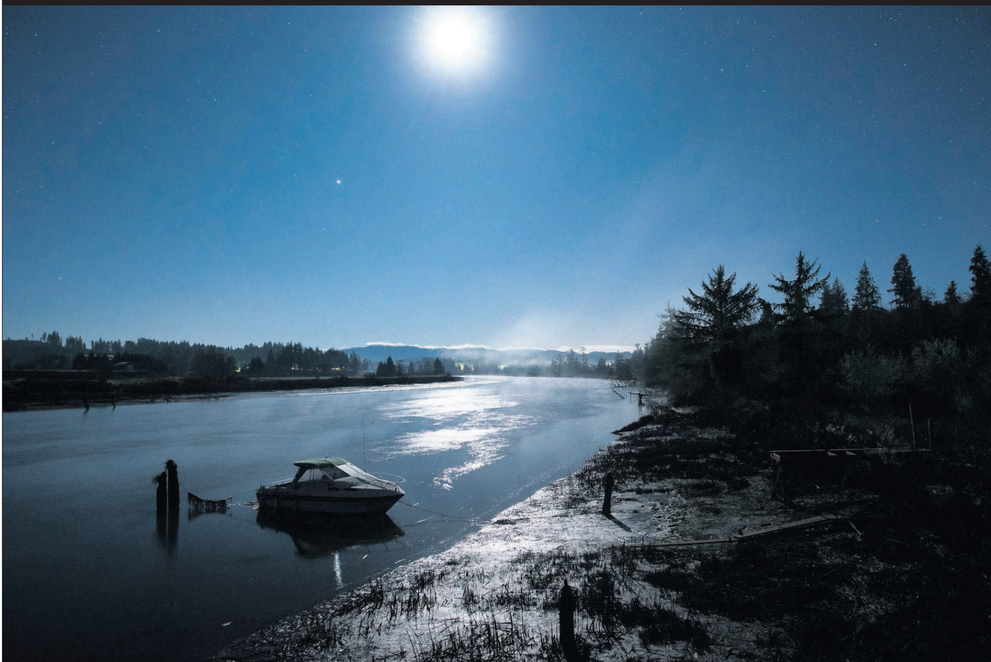
Midnight on the Wallooske River.

A weekly snapshot from The Daily Astorian and Chinook Observer photographers