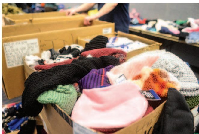
Boxes of clothing sit on a table for people to take during the Project Homeless Connect event.