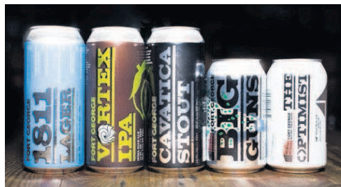
Fort George's current lineup of canned regular beers is, from left, the 1811 Lager, Vortex IPA, Cavatica Stout, Big Guns and The Optimist.