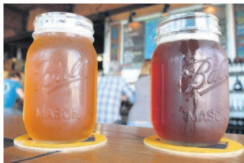
Fort George Brewery crafts regular, seasonal and creative occasional beers. Pictured are the seasonal Fresh IPA, left, and the Squash Buckler.

BEST BAR, BEST BREWPUB, BEST PIZZA & BEST SERVER