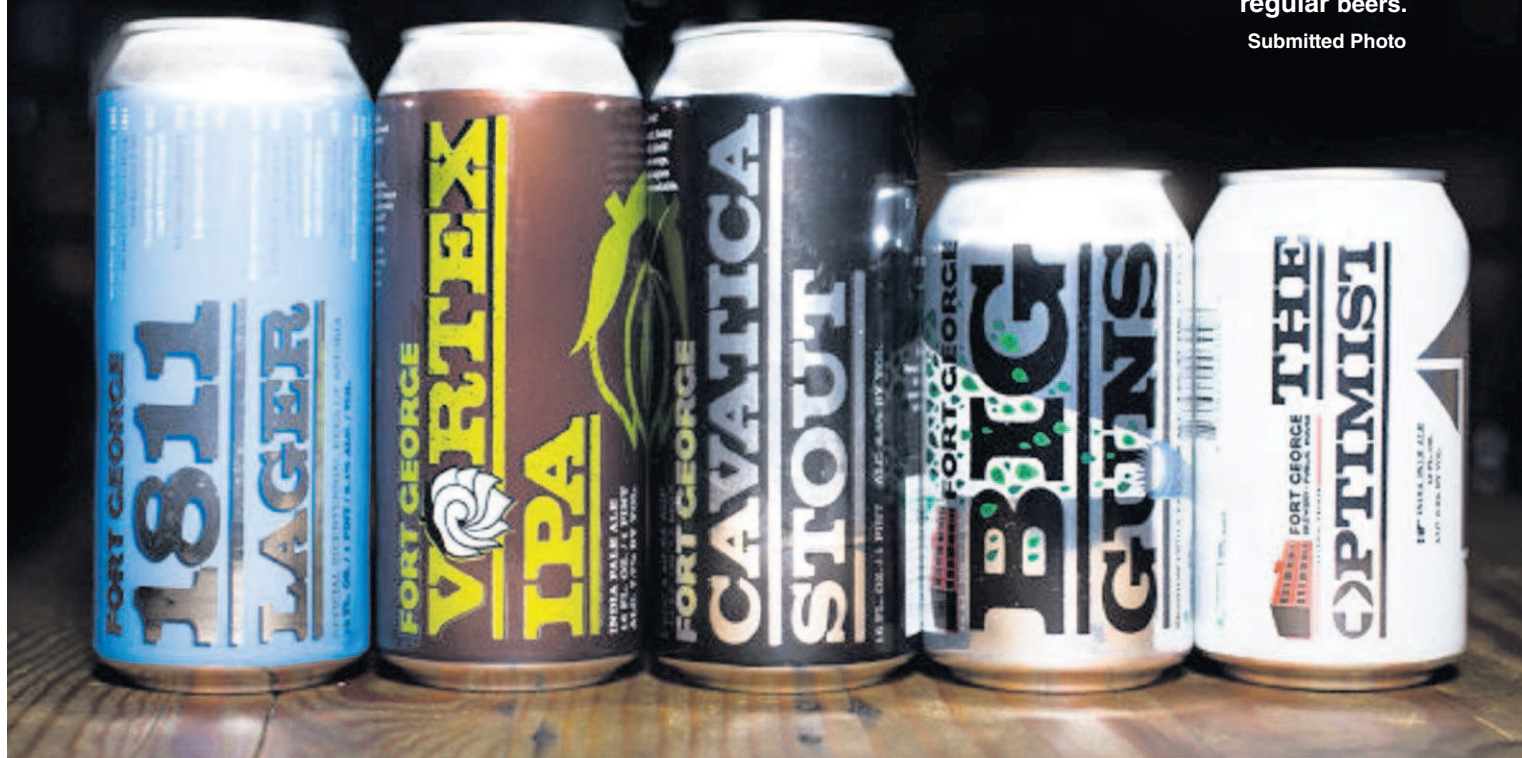
Fort George's canned regular beers.