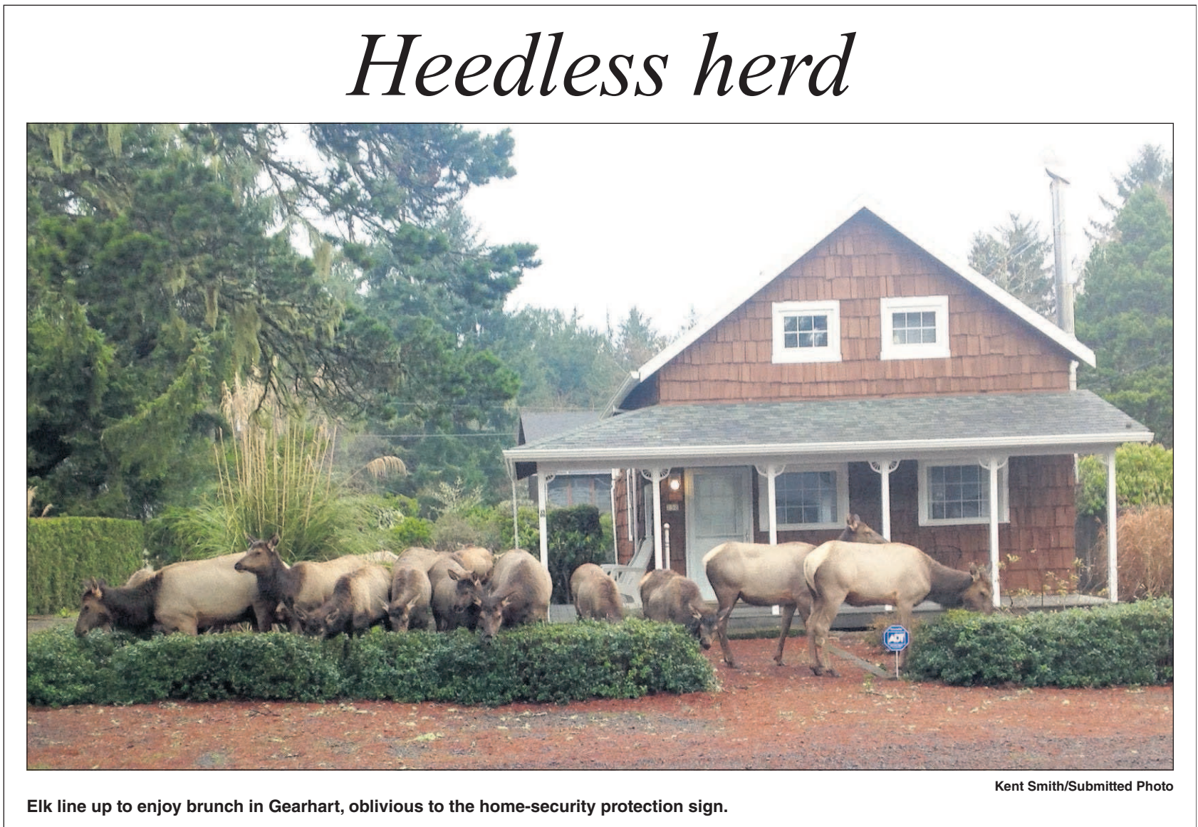
Elk line up to enjoy brunch in Gearhart, oblivious to the home-security protection sign.

Wickiup Senior Lunches — 11:30 a.m., Wickiup Grange Hall, 92683 Svensen Market Road. Free for those older than 60 ($3 suggested donation), $6.75 for those younger than age 60. For informa-