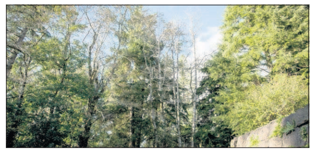
The Astoria City Council voted Tuesday night to reject a new 150-foot Verizon monopole in Shively Park.