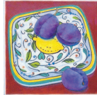
This artwork called "Plums" is one piece that will be at this year's Art a la cARTE.

available at the Liberty Theater box office or through ticketswest.com