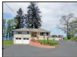
93102 Labeck Rd, Astoria $465,000