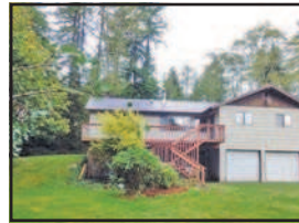
42457 Hwy 30, Astoria $205,500