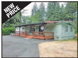
NEW PRICE 92224 Simonsen Rd, Astoria $169,900