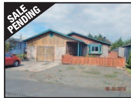
SALE PENDING 1186 Avenue E, Seaside $144,500