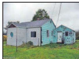
92195 Clover Rd., Astoria $84,900