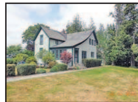
36345 Bartoldus Loop, Astoria $440,000