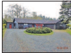
91535 Smith Lake Rd, Warrenton $315,000