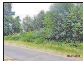
40490 Old Hwy 30, Astoria $75,000