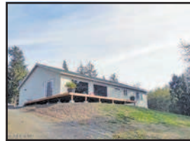
36374 Ordway Lane, Astoria $299,000