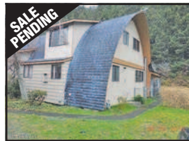
SALE PENDING 33677 Cullaby Lake Ln, Warrenton $164,900