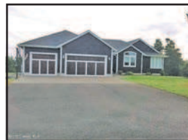
89089 Steller, Warrenton $449,900