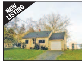
NEW LISTING 35655 Dow Ln., Astoria $151,900