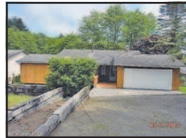
91923 Ridge Rd, Warrenton $279,000