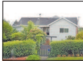
758 Florence Astoria $215,000