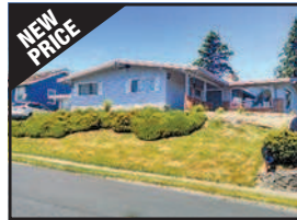
NEW PRICE 84 Skyline Ave, Astoria $299,999