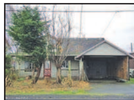
92384 G Rd., Astoria $50,500