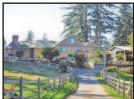
75 SW Juniper, Warrenton $1,150,000