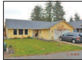
1308 Park Ln., Gearhart $258,000