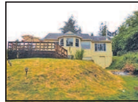
91579 Hwy 202, Astoria $199,000