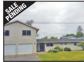
SALE PENDING 749 Desdemona, Hammond $180,100