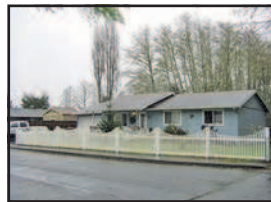
SALE PENDING 180 NW Gardenia, Warrenton $169,900