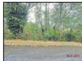
255 Waldorf Circle, Astoria $75,000