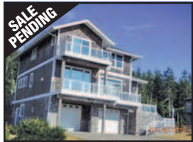
SALE PENDING 2068 Cooper Dr, Seaside $349,900