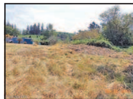
41055 Hillcrest Loop, Astoria $50,000