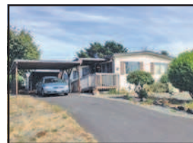
90971 Hwy 101 #34, Warrenton $28,500