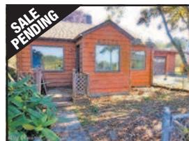
SALE PENDING 92173 Clover Rd, Astoria $82,000