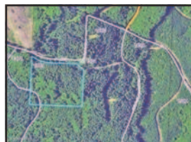
Pipeline Rd., Astoria $110,000