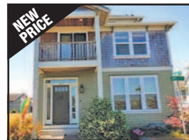
NEW PRICE 235 23rd St., Astoria $338,900