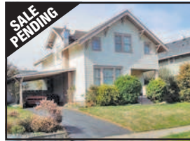
SALE PENDING 1435 6th Street, Astoria $225,000