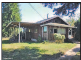
92905 Keller Rd., Astoria $126,000