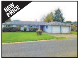
NEW PRICE 37724 Parker Ln., Astoria $199,900