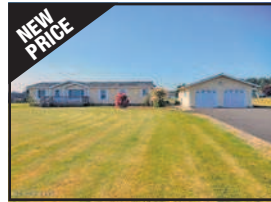
NEW PRICE 92870 Amie Loop, Astoria $207,000