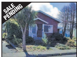
SALE PENDING 941 4th Ave., Seaside $137,700