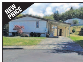
NEW PRICE 365 Forest Court, Seaside $59,500