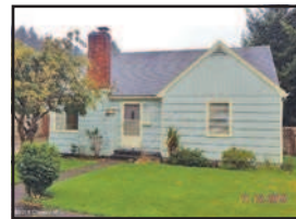
SALE PENDING 3554 Harrison Dr., Astoria $139,000