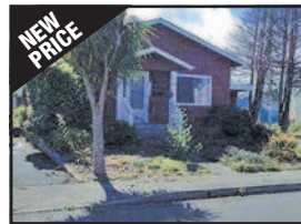
NEW PRICE 941 4th Ave, Seaside $152,700