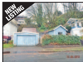
NEW LISTING 163 Bond St., Astoria $52,000