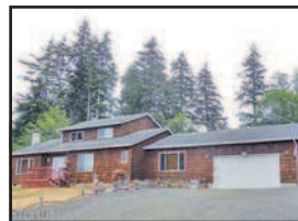
35179 Labrador Lane, Astoria $450,000