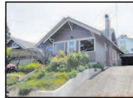
1359 Irving, Astoria $245,000