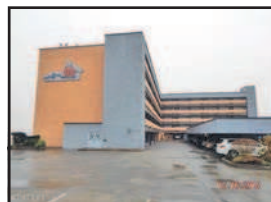
1 3rd Street #404, Astoria $299,000