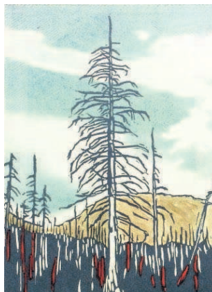
"Afterlife" by Stirling Gorsuch at RiverSea Gallery.