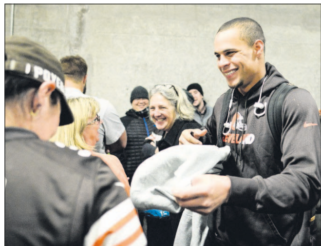
ABOVE: Jordan Poyer smiles as he talks with family and friends after the game. LEFT: After the game, Jordan Poyer poses for a photo with his uncle, Chris Crocker, while meeting with friends and family.