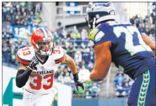
Jordan Poyer blitzes during a play in the third quarter of the football game.