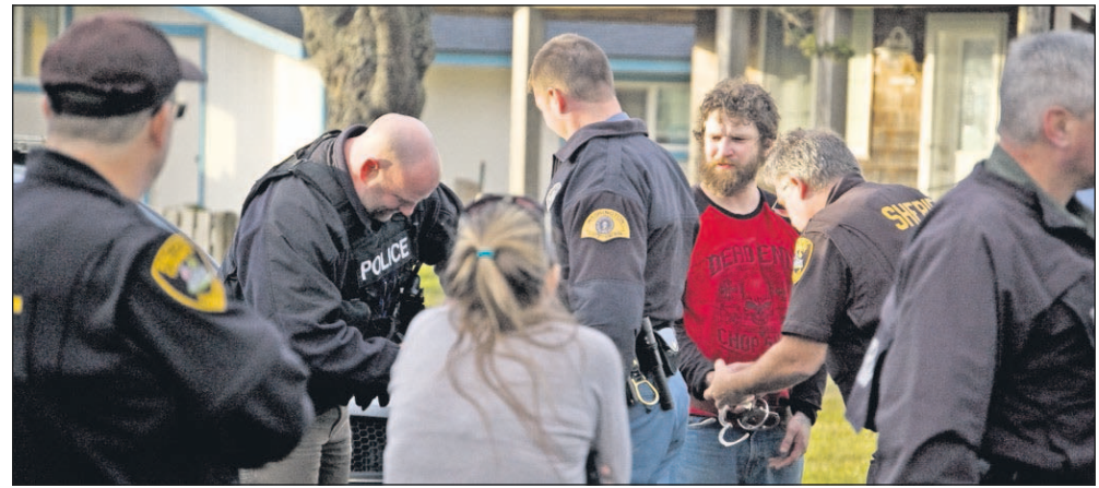
Kathryn Houghton/EO Media Group

Shown are noon positions of weather systems and precipitation. Temperature bands are highs for the day. Forecast high/low temperatures are given for selected cities. Weather (W): s-sunny, pc-partly cloudy, c-cloudy, sh-showers, t-thunderstorms, r-rain, sf-snow flurries, sn-snow, i-ice.