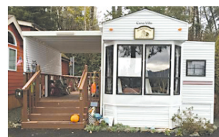
Park Mdl $25k, 1bd-1ba, nw rmdl, frnshd new W/D, deck in curr loc on NehRiver rent is 410mo. 503-440-9733