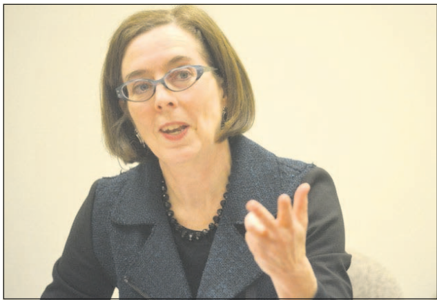
Gov. Kate Brown

Congress and the president set policy on accepting