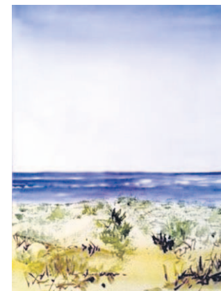
Submitted photo “Beach Scene” by Kathryn Murdock.

collections all over the world. She recently switched from oils to watercolor and lives on the peninsula to enjoy the slower pace of life.