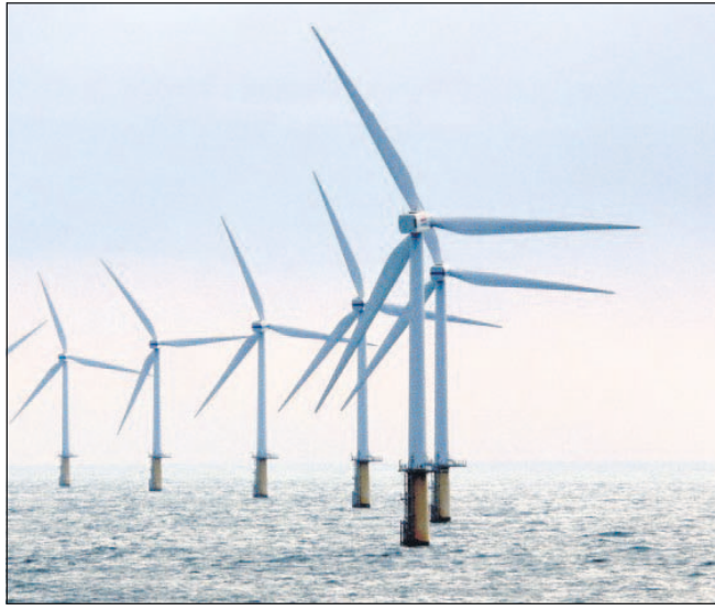
Princess Amalia Wind Farm in the North Sea of the Netherlands.