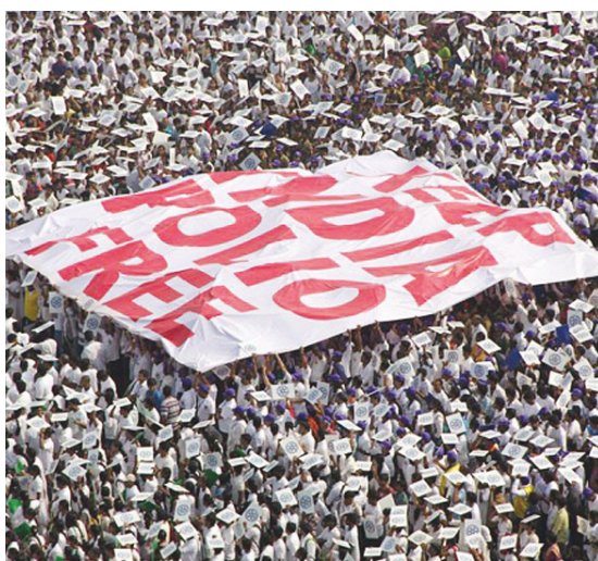
People in India celebrating their country's four years since their last case of polio.

What is Rotary ? It's a global network of volunteers. Find out if you have a Rotary Club in your community that might have a member who can speak to your class about the efforts to end polio.