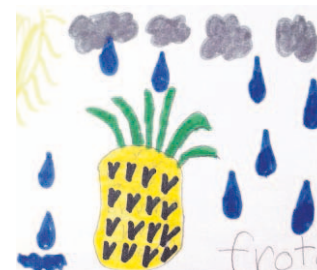
You can doodle and enjoy food at Old Town Framing during art walk.