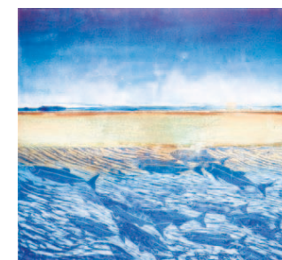
"Plenty for All," a woodblock monoprint by Penny Treat at RiverSea Gallery.