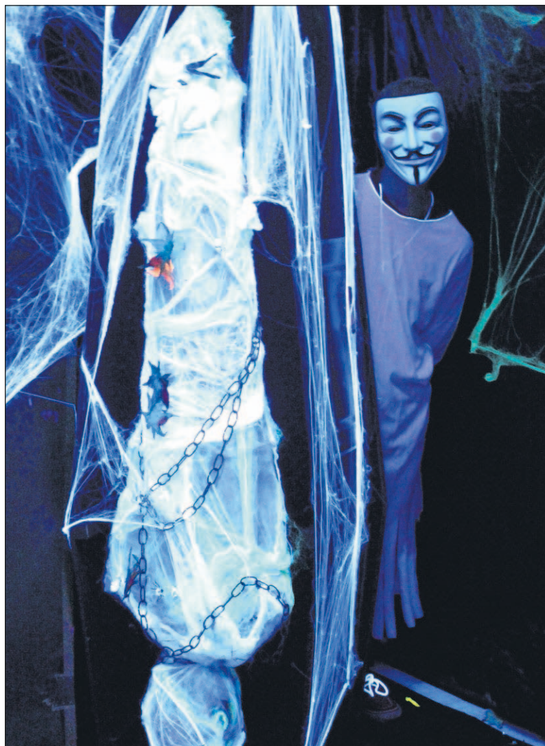
A creepy cemetery scene took over the Sunset Empire Park & Recreation District’s Youth Center during the annual Thriller haunted house event last year, one of Seaside’s signature Halloween happenings.

Visitors to the coast should remain out of the surf zone and off jetties this weekend. Breaking waves will vary greatly in size and could easily sweep people into the water. Waves have the potential to roll driftwood logs and trap people underneath. Mariners will likely encounter unusual hazards this weekend.