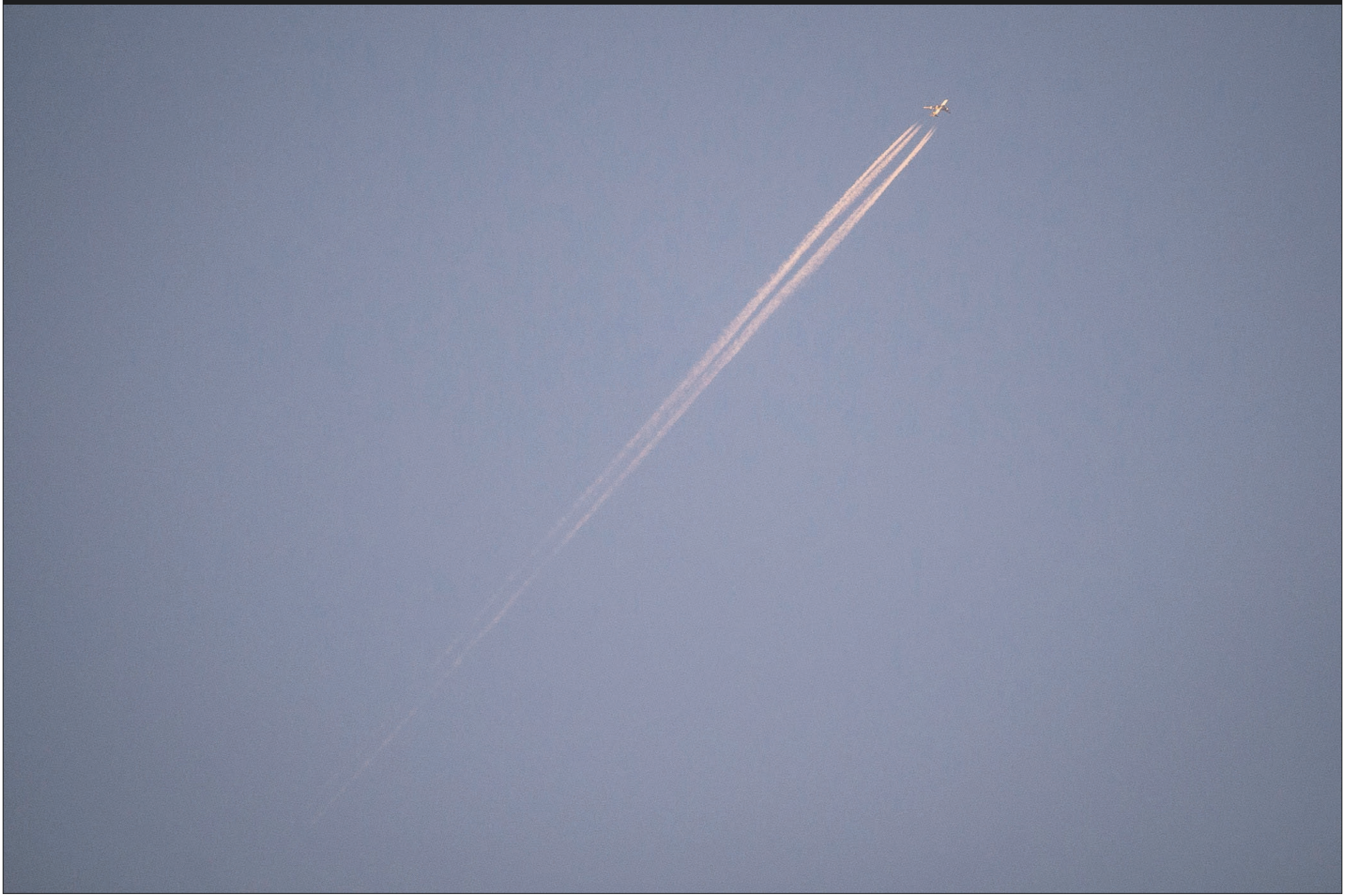
A plane flies over CMH Field.

A weekly snapshot from The Daily Astorian and Chinook Observer photographers