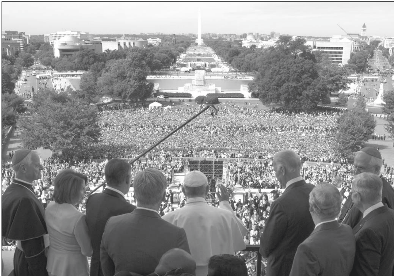
Pope Francis along with the congressional leadership, and local clergy, speaks from the Speaker's Balcony on Capitol Hill in Washington today following his address to a joint meeting of Congress.

Lawmakers of all political backgrounds and religious affiliations eagerly welcomed the pope, pledging to pause from the bickering and dysfunction that normally divide them and hear him out. Yet Francis spoke to a Congress that has deadlocked on immigration legislation, at a time when there are