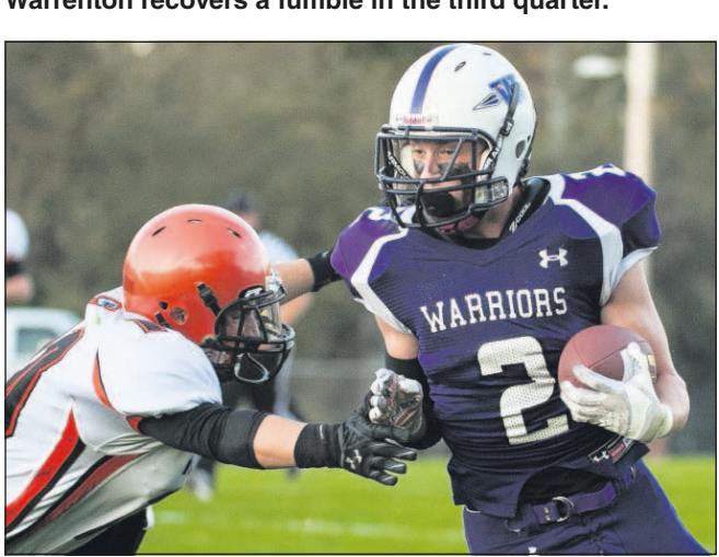
Warrenton recovers a fumble in the third quarter.