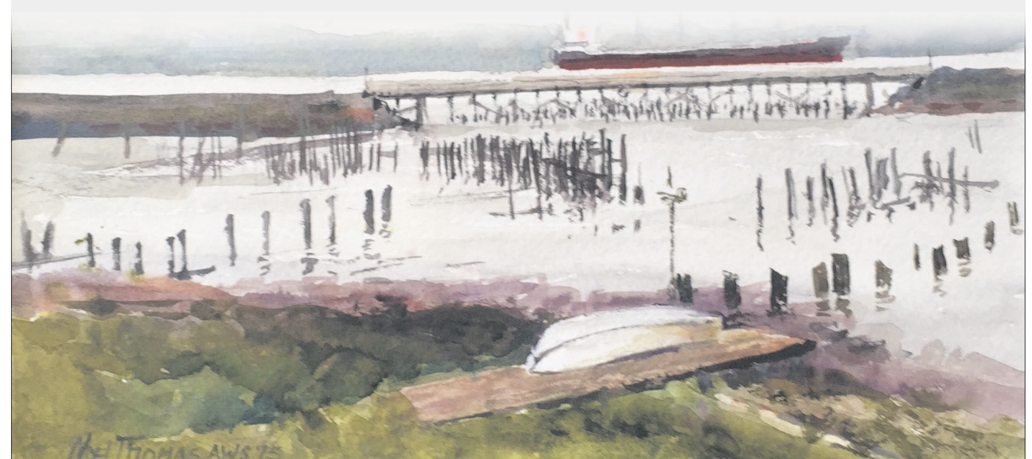
Alderbrook: This painting was done on a quiet morning across the street from Chris Bryant's Birch Street gallery.