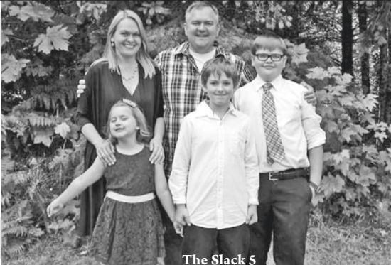
The Slack 5