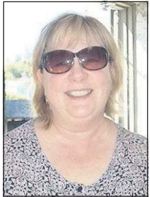
"Clothes shopping for the new school year. New clothes!"

'What is a favorite back to school memory?'