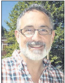
"School was nothing I looked forward to going back to. I spent all my summers on my grandparents' farm, an would have preferred to stay there."