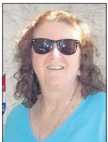
"Going to my grandparents' cabin, outside Klamath Falls, the last few weeks of summer."